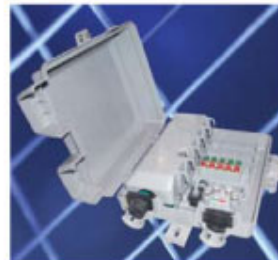
Corning® 7600 Enclosure

TDI 11100 Airport Drive, Suite 8 Hayden, ID 83835 208-660-5135 208-772-6196 fax